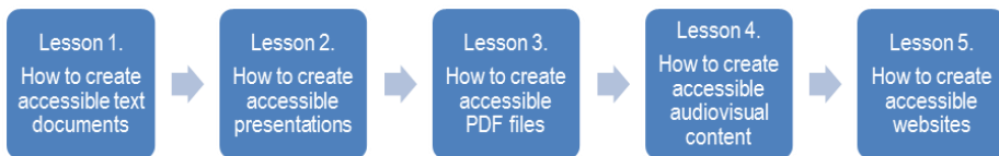
Fig. 1. Syllabus of the course

The course was composed of four mandatory lessons (Lessons 1 to 4) and one optional lesson (Lesson 5) [9]. We decided to add the last lesson as an optional lesson because many teachers do not have technical skills; therefore, they would not have been able to follow the content in Lesson 5 because it requires some knowledge of programming, but still it could be interesting for some of them. The main topics to be explained in each lesson are shown in Fig. 1.